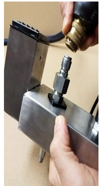
Attach Autoshot to Hose