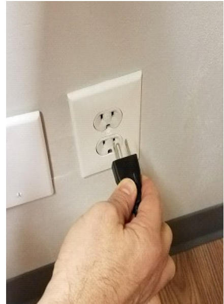
Plug System In