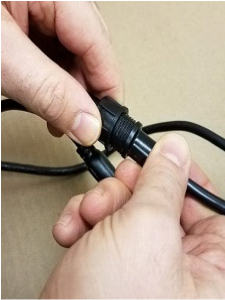
Connect 5-Pin electrical connection between Pump and Hose