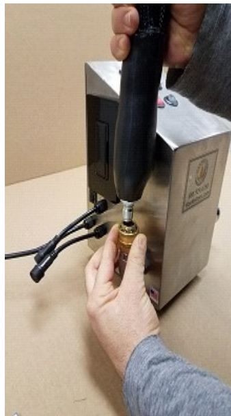
Attach Hose to Pump