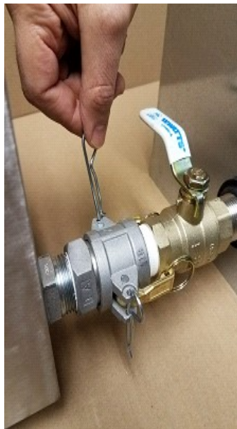
Insert "Locking" PIN