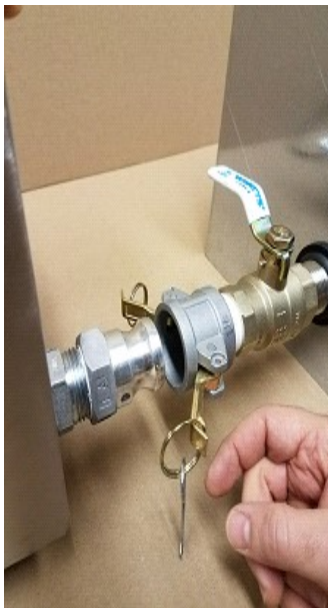
Attach Pump to Valve