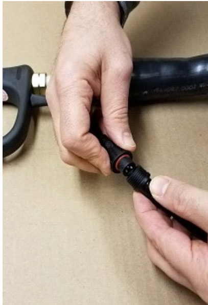
Connect 3-Pin electrical connection between Hose and Dispensing Head